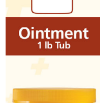
A + D Ointment Tub

It's a wonderful thing when babies start sleeping through the night. However, along with that much needed extra sleep comes more exposure to soiled diapers. This, in turn, irritates babies' sensitive skin and can cause diaper rash.