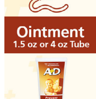
A + D Ointment Tube