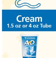
A + D Cream Tube